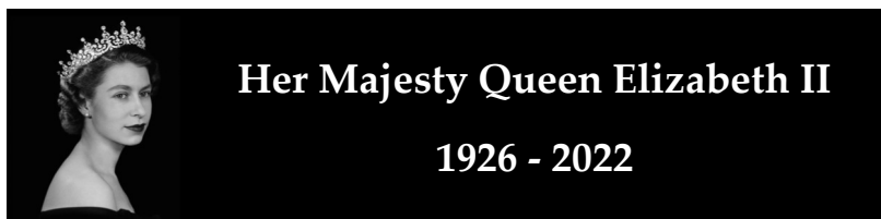
Her Majesty Queen Elizabeth II

The Village Voice is sponsored by West Wickham Parish Council and delivered free to all households in West Wickham and Streetly End. The views expressed herein are those of the contributors.