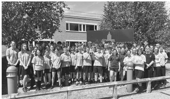
LVC's proud 'Olympic Cup' winners.

Throughout the school year, we participate in a wide range of local sports fixtures and activities. This summer, over fifty of our talented athletes represented LVC at the annual district sports competition, competing in both track and field events against schools across Cambridgeshire. Many students achieved personal bests, and several won their respective events. We are incredibly proud to have placed first overall, earning the prestigious 'Olympic Cup' a remarkable achievement for our school.